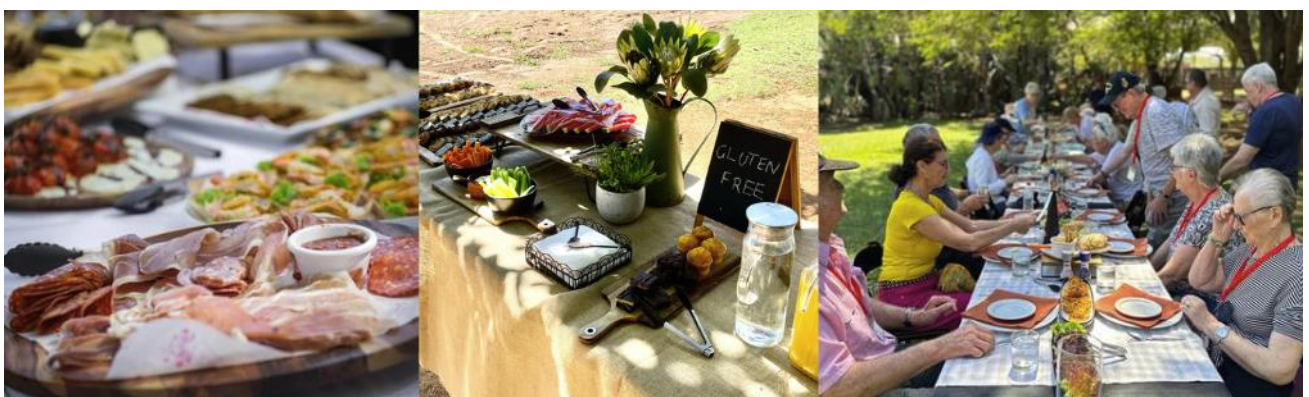
Figure 9: When catering for events, we do our best to accommodate dietary requirements and requests if advised in advance.