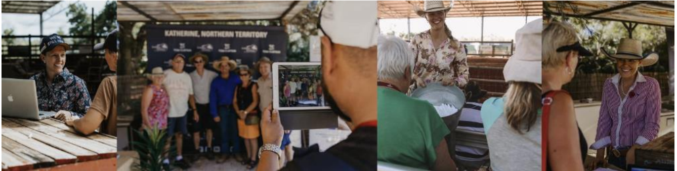
Figure 11: Our Katherine Outback Experience Team are always on hand to assist where they can.

Our friendly team are always willing to assist where possible. To improve our Customer Care Support: