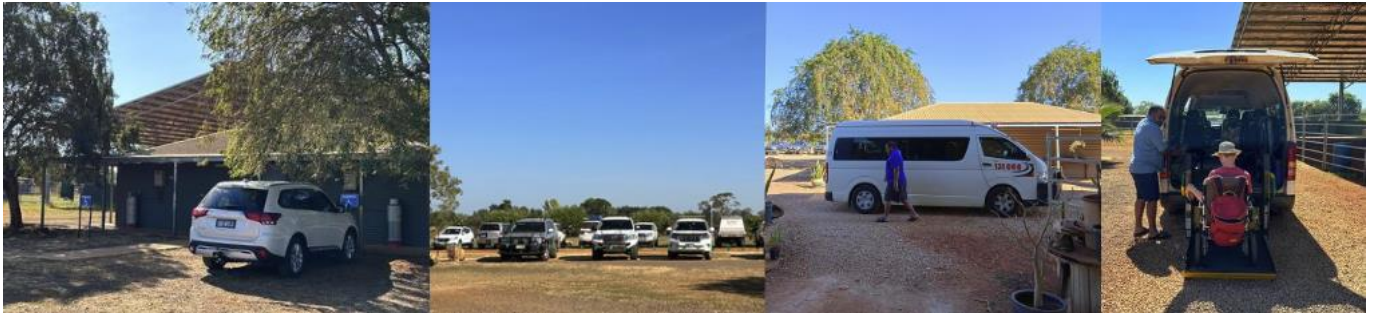
Figure 3: Parking at Katherine Outback Experience including designated Disabled Parking Bays, general parking bays, Taxi drop-off/ pick-up area adjacent to Arena 2