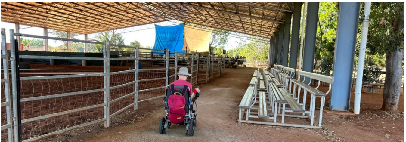
Figure 4: Wide flat accessways throughout the site at Katherine Outback Experience

All pathways throughout the site are flat and made from cracker-dust allowing them to be traversed easily on foot, with wheels and walkers.