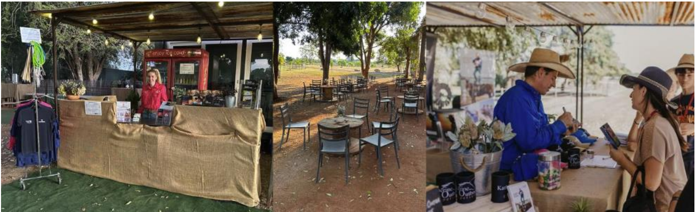
Figure 5: Check-in/ Reception space with lower desk for accessibility. Breakout space with ample space for wheelchairs/ prams to move around tables. Open air space shop space.

The 'check-in/ reception/ shop' area is all outdoors and undercover on level ground. The reception desk has two levels allowing us to service wheel chairs. We regularly step-out from behind the desk to check-in guests and provide a pre-show brief. The space is open plan with wide walkways with more than sufficient space for wheelchairs and prams to move through.