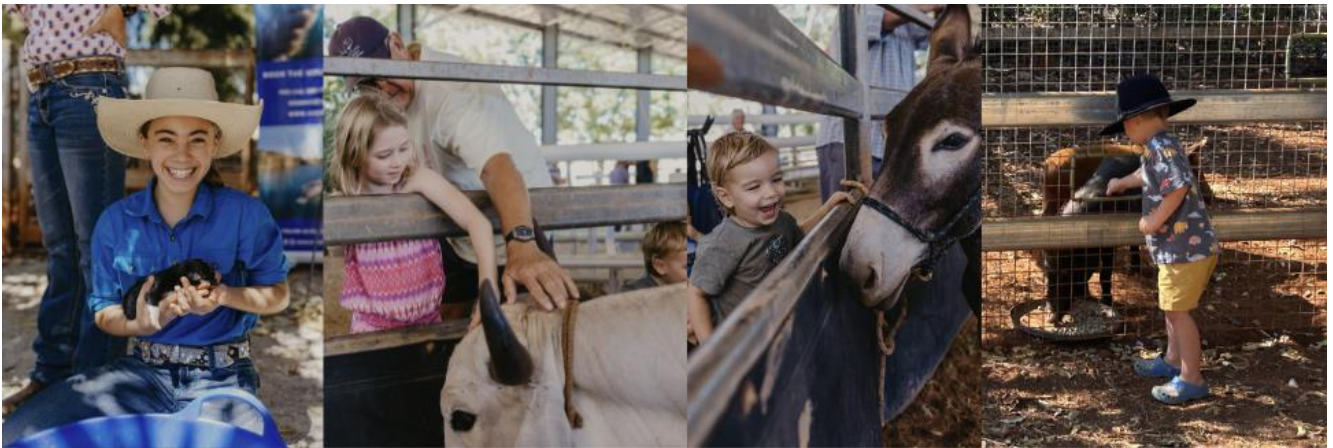
Figure 8: There are various opportunities to pat and feed the station animals. We will often look for opportunities to bring a working dog or horse to a guest in a wheelchair. We encourage guests to reach out and request this in advance.

There are opportunities to pat and feed animals during the Show and the activities. To maximise inclusion of this activity, we have: