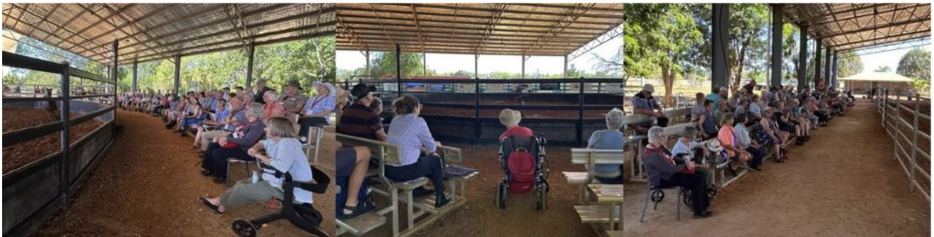
Figure 7: Three-tier grandstand seating with ample space for wheelchairs, walkers and prams and for members of the travelling party to sit on a chair adjacent to the wheelchair

Seating around Arena's 1 and 2 includes: