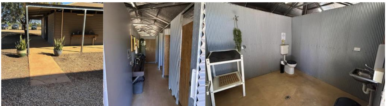
Figure 6: Toilet/ Shower Complex access path. Entry to Ladies toilets. Universally accessible unisex bathroom with moveable baby change table.

Our amenity block at Katherine Outback Experience includes: